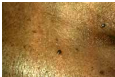
60-YEAR-OLD SUBJECT, FITZPATRICK SKIN TYPE V

“After six weeks, I noticed a huge improvement. I really love my new routine.”